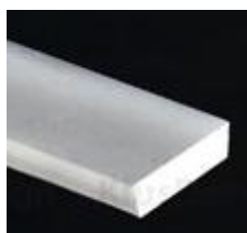
cover frosted (0945)