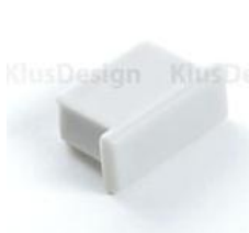
end cap without hole (00010) with hole (00347)